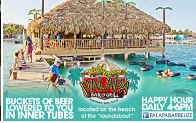
Page 12 My Beautiful Belize, A Visitor's Guide - San Pedro, Ambergris Caye, Belize